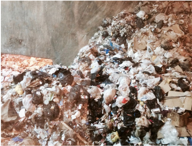
Figure 1. A “waterfall” of garbage runs down the concrete pit at BRESCO, an incinerator in Baltimore, 2016. [This figure appears in color in the online issue]

know that he saw things perfectly clearly, and burning trash was “the best option we’ve got.”