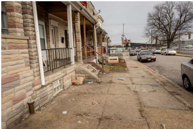
Figure 4. Garbage litters Hazel Street in Curtis Bay, Baltimore, 2014. [This figure appears in color in the online issue]

kind of pathology—and cleanliness, its opposite, conveys virtue: