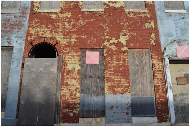
Figure 3. Like much of Baltimore city, the Curtis Bay neighborhood is plagued by board-ups, 2014. (United Workers) [This figure appears in color in the online issue]

Taken together, these synchronous declines suffuse the terrain where working-class whites imagine renewal; they tinge the pasts people mourn and the futures they believe tenable with racism, disenchantment, and destitution. The associations between economic downturn, environmental contamination, and the arrival of racialized Others further point toward the affective and interpersonal tensions that emerge when people anticipate their own exclusion (Molé 2010). But they also suggest why residents might hope against decline, marshaling anachronistic visions of industrial revival when they think about the future. As Felix Ringel (2014) writes of postindustrial Germany, hope need not be transformative to count as such. People who feel that the ground is falling out beneath their feet may cling steadfastly to the good life they once knew. In Ringel's work, this attachment takes the form of maintenance, or attempts to sustain the built environment from crumbling into ruin. By drawing attention to "endurance (as change) rather than . . . change (as change)" (Ringel 2014, 57), he argues for expanding temporal agency to capture how people hold fast when the future seems likely to exclude them.