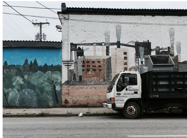
Figure 6. Reminders of the industrial past line “the Avenue” in Curtis Bay, Baltimore, 2015. (Chloe Ahmann) [This figure appears in color in the online issue]

In many ways, assertions like this resemble a Faustian bargain: they signal unfortunate trade-offs and reinforce false dichotomies. In this sense, they are not unlike desire for the Fairfield Project. As I have shown, this desire gained traction in Baltimore as the result of affectively charged, historically informed, conditional logics. For Curtis Bay’s white working class, the project seemed poised to facilitate its reintegration into the national economy and revive other aspects of the industrial era (see Figure 6)—including a racialized sense of community cleanliness. And for technocrats, waste-to-energy’s promised boons were made all the more attractive when compared with older waste and energy technologies. Like Bill’s defense of coal, these maneuvers could be interpreted as signs of delusion or short-sighted buy-ins to industrialism’s value structure. Or we could, following Arlie Russell Hochschild (2016, 135), explain them through a “deep story,” attributing paradoxical positions to “how things feel” when they seem lacking in logic. But these interpretations fail to account for the complex, even sophisticated analytical field I have called subjunctive politics. They do not clarify why people who are remarkably clear eyed about their circumstances nonetheless make choices to their detriment. Remember: the subjunctive is not a space outside reason. It is a space where options