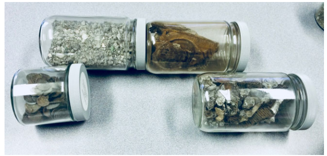
Figure 5. The CEO of Energy Answers showed me recovered materials taken, postcombustion, from an incinerator in Rochester, Massachusetts, 2016. (Chloe Ahmann) [This figure appears in color in the online issue]

Over time, my surprise about residents’ readiness to accept the incinerator faded as I heard more of them make comparisons that portrayed it as a cleaning technology instead of as one that would lure more waste to the community. The argument that “it could’ve been worse” was also prevalent, since people figured the project would be “better than another dump” and preferred it to a chemical plant. But their enthusiasm about the Fairfield Project was closely bound to discourses of renewal—a renewal of economic stability, social standing, and a homogeneous laboring community. Such discourses make sense only when set against the specter of the more toxic past and recast as restricted orientations toward the future. And though white working-class optimism might reflect a cruel attachment (Berlant 2011) to the dynamics that had produced their own exclusion, these comparisons suggest instead that