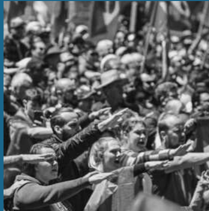
Bolsonaro supporters give Nazi salute during Brazilian anthem

people dying from asphyxiation during the pandemic. He encourages burning the Amazon, and books. He closes universities or leaves them writhing through draconian budget cuts. He encourages gold prospectors in the Amazon who kidnap and rape young Indigenous people. He has liberated gun purchases, and revived Nazi slogans ("Brazil above all", "work makes you free").