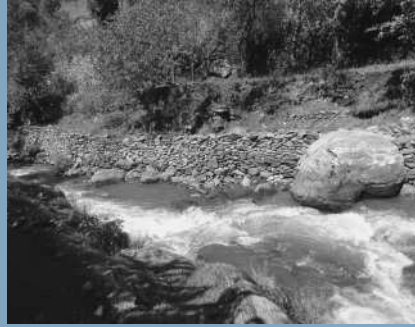
A dated flood protection wall installed by an NGO, following floods in 2010. The structure has since then deteriorated

“What is the point?” one disaster management official stationed in the region confided, “Whatever we build will either be destroyed by the Indian army or swept away by the river or by landslides.”