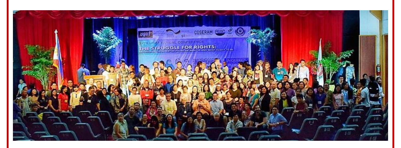
2017 UGAT Conference, Cagayan de Oro City, the Philippines

The UGAT (Ugnayang Pang-Aghamtao, Inc./Anthropological Association of the Philippines) held its 39th Annual Conference last November 9-11, 2017 on the theme "The Struggle for Rights: Anthropological Reflections on What Is, and, What Ought to Be", at Capitol University, Cagayan de Oro City with significant participation from Indigenous Peoples. Perhaps the 40th UGAT conference in 2018 may host a WCAA interim meeting.