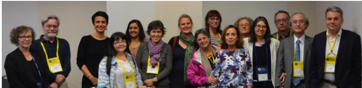
WCAA Meeting held in San José

Among the topics under discussion, the participation of WCAA in the Open Anthropological Research Repository (OARR), an initiative of AAA was reviewed. During the 6 th WCAA meeting, the majority of delegates present in Florianópolis were against the participation of the WCAA in this initiative (although, there were almost half in favor), but following changes made to the proposed project, a large majority of the delegates present in San José were in favour of our participation in the OARR. A final decision will be made shortly after a consultation of the WCAA member associations.