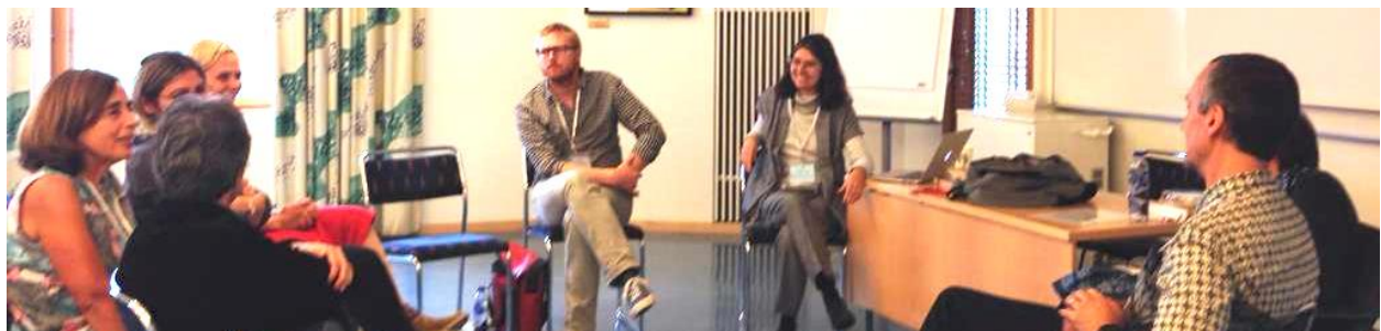
WCAA Meeting in Stockholm

Among the topics under discussion, the participation of WCAA in the Open Anthropological Research Repository (OARR), an initiative of AAA was reviewed. During the 6 th WCAA meeting, the majority of delegates present in Florianópolis were against the participation of the WCAA in this initiative (although, there were almost half in favor), but following changes made to the proposed project, a large majority of the delegates present in San José were in favour of our participation in the OARR. A final decision will be made shortly after a consultation of the WCAA member associations.