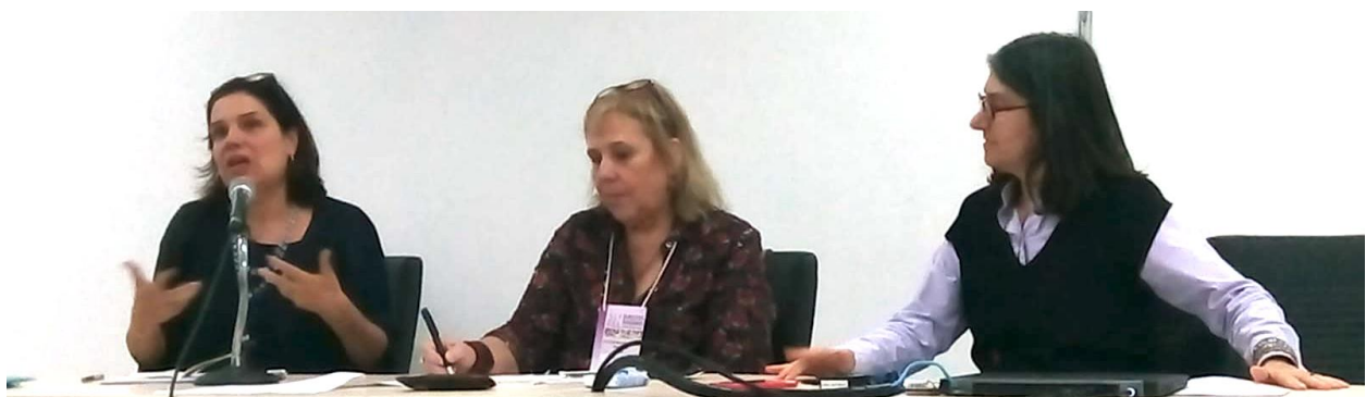
WCAA Meeting in Brasília

The Electronic Conference Proceedings of the 18th IUAES World Congress/ Florianópolis can be downloaded at this webpage .