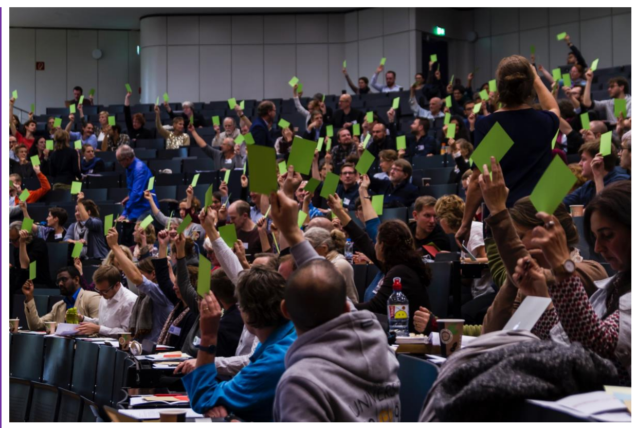
Members' voting at the GAA general meeting on 6<sup>th</sup> October 2017